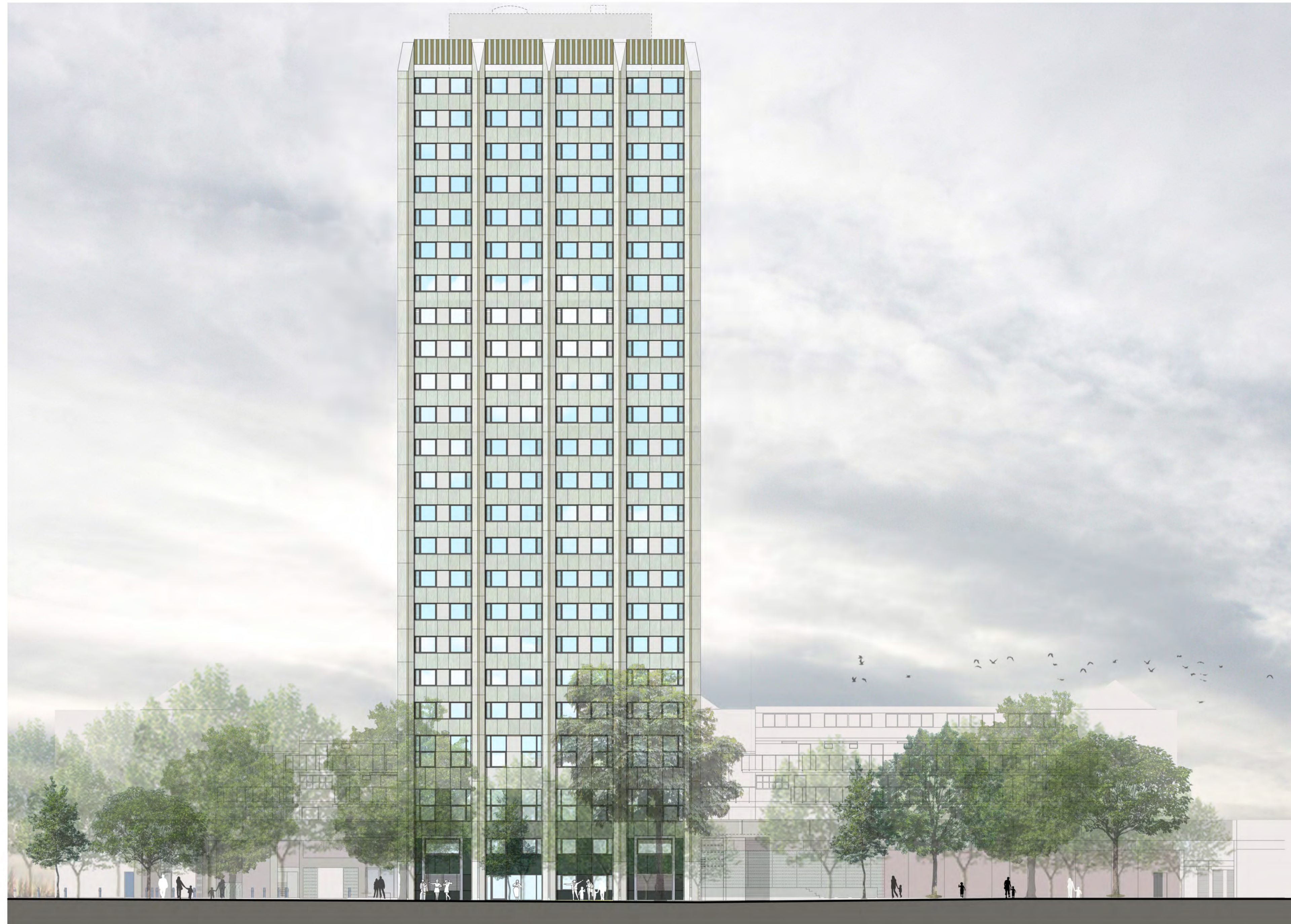
4 NORTH ELEVATION 1:200