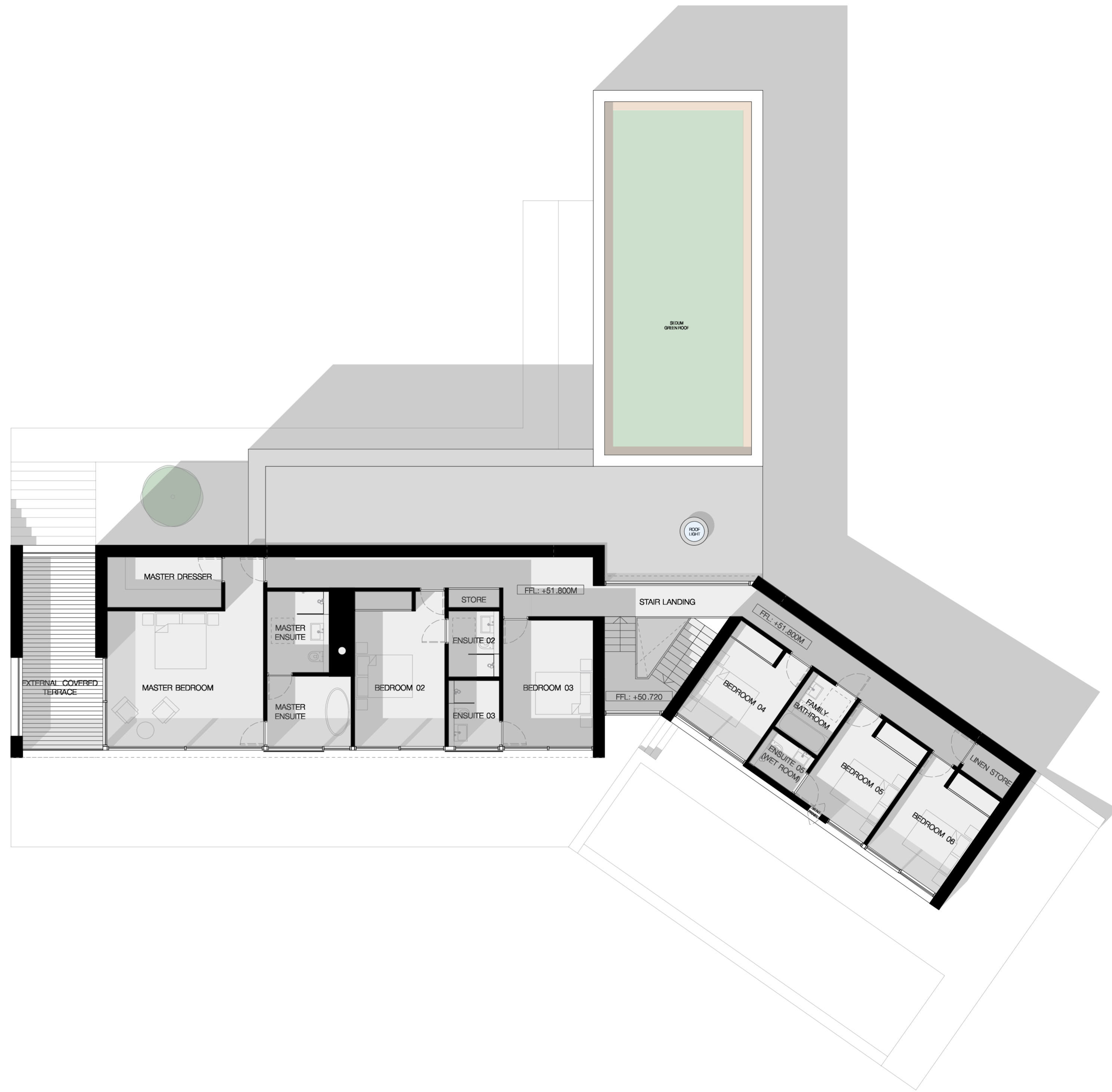
PROPOSED FIRST FLOOR PLAN (1:100 @ A1)