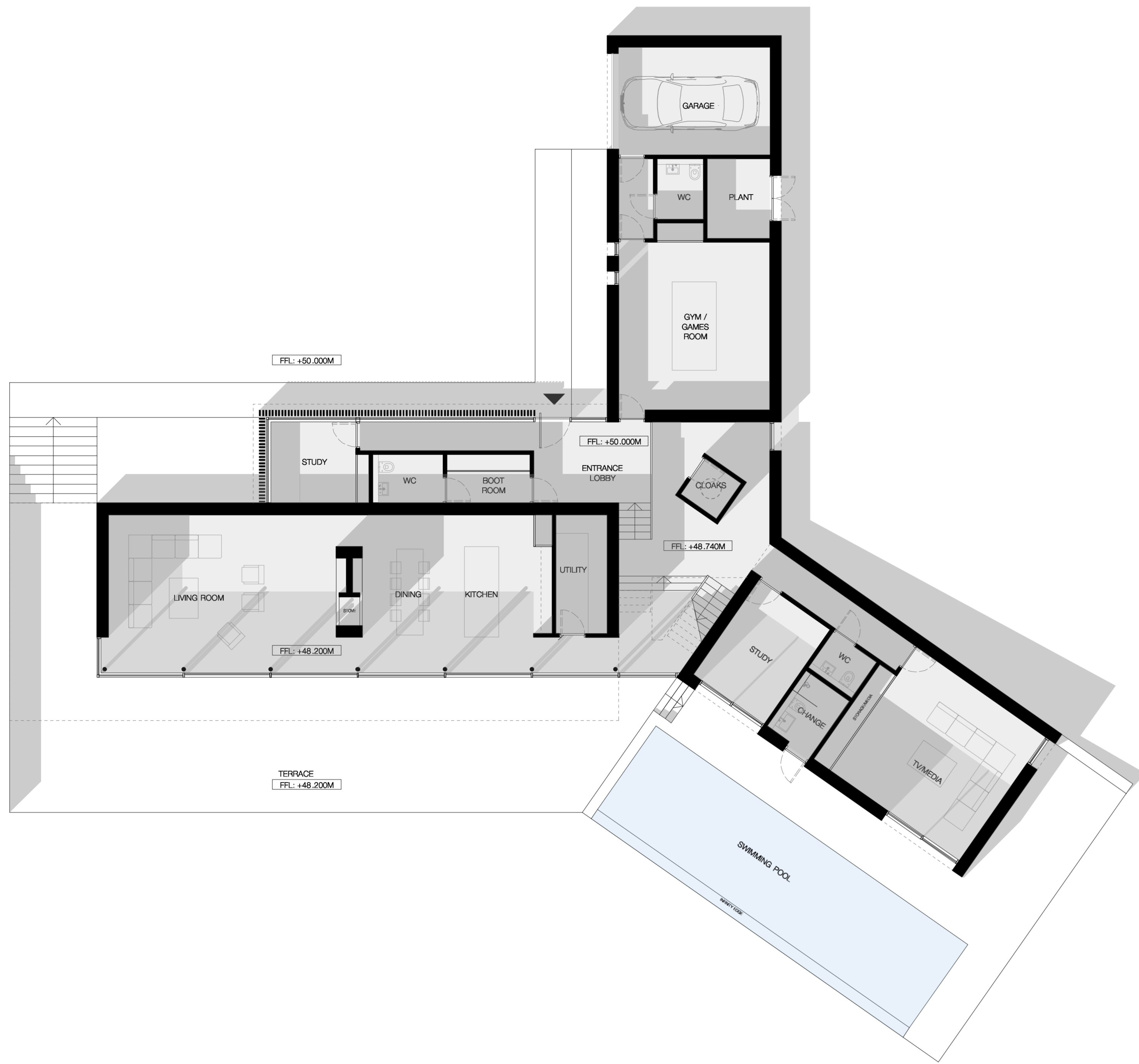
PROPOSED GROUND FLOOR PLAN (1:100 @ A1)